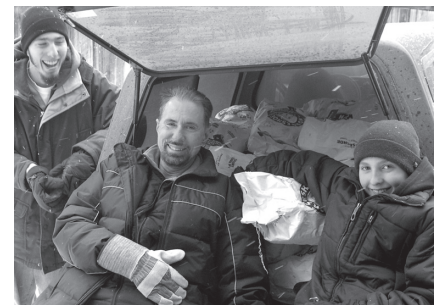
Steinmann Mennonite Church volunteers enjoy unloading spuds

House of Friendship thanks everyone who contributed to the Potato Blitz this year. Your help to provide food assistance is greatly appreciated.