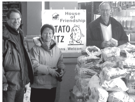
St Andrew's Presbyterian volunteers solicit at the Glenridge Zehrs store

Volunteers from six Presbyterian Churches in K-W solicited nine supermarkets on February 17, 2007 for the Potato Blitz. They collected 19,191 pounds of potatoes and $6146 in cash for an equivalent of 80,654 pounds, the highest total to date!