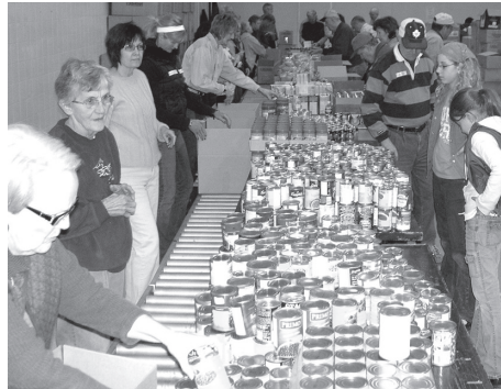
Volunteers on the Christmas Hamper packing line in December 2006